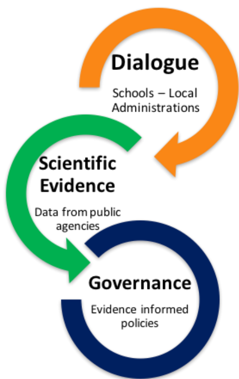
Fig. 2: GIOCONDA's Concept

Novelty of GIOCONDA was to demonstrate the efficiency and efficacy of including these findings in a participatory process , where pupils formulated their recommendation to the local policy makers basing on evidences .